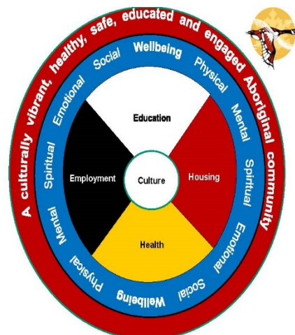
AWC Working Model